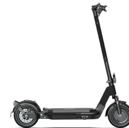
FOB TW $485 USD

M6 City Glider -500 watt motor -48v14ah Battery -Front & rear suspension -Integrated display -Foldable customisable