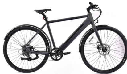
FOB TW $880 USD

M1 City Rider Unisex -Smooth-welded frame -250 watt motor -36v7ah battery -Singlespeed -Hydraulic Disc brake customisable