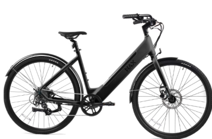
FOB TW $880 USD

M2 City Rider Stepthru -Smooth-welded frame -250 watt motor -36v7ah battery -Singlespeed -Hydraulic Disc brake customisable