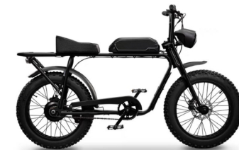
FOB TW $550 USD

M5 City Moped -250 watt motor -36v11ah battery -Shimano 5 speed -20" fat tire customisable