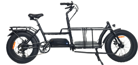
FOB TW $1090 USD

M4 City Cargo -250 watt motor -36v14ah battery -Shimano 7 speed -20" fat tire -Foldable customisable