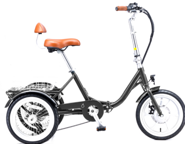
FOB TW $950 USD

M3 City Wagon -20" Tyre, MD -250 watt motor -36v10~20ah battery -Shimano 7 speed -Mechanical Disc brake customisable